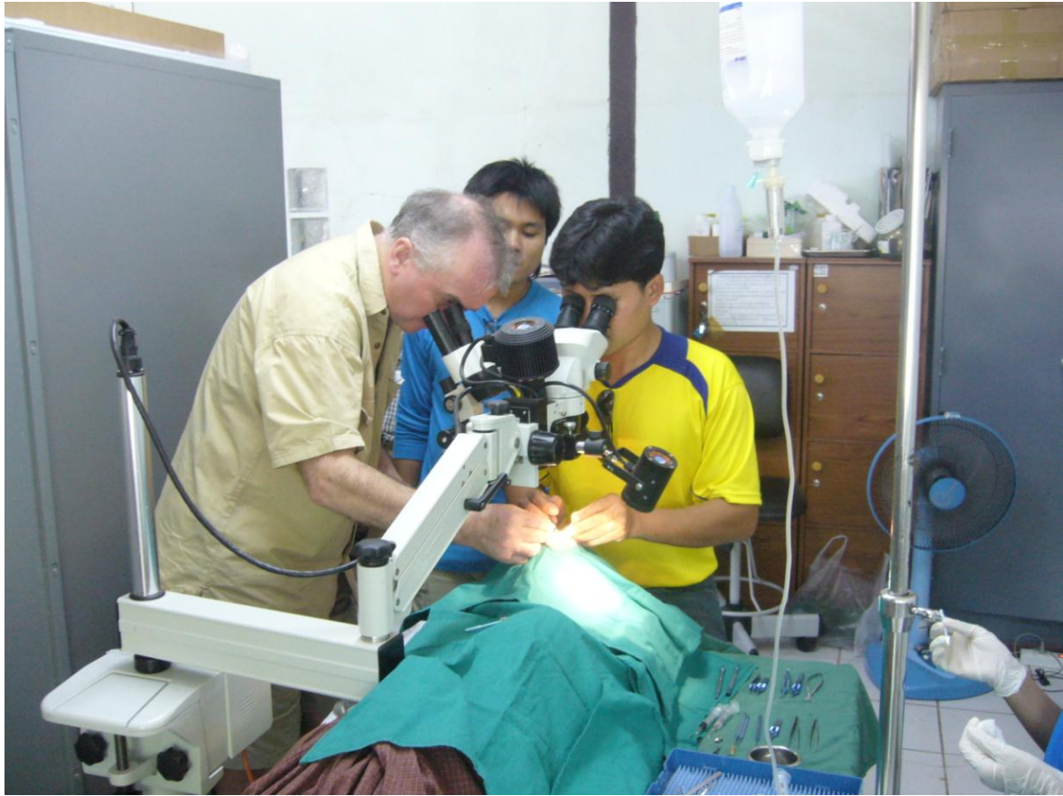
Cataract surgery with donated equipment at Mae Tao Clinic 2011