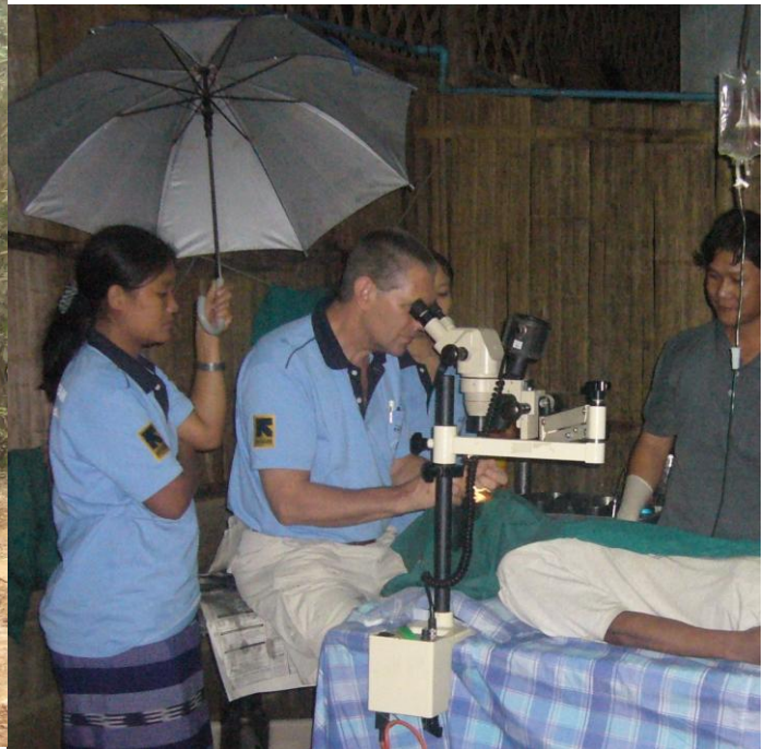
Eye surgery in the rainy season