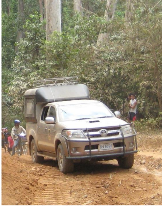
Travel to remote border camps